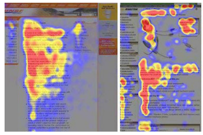
Heatmap reader tracking from Nielsen Norman Group

You can use this in design by aligning important information left, using subheadings, bullet points and pull quotes to attract attention.